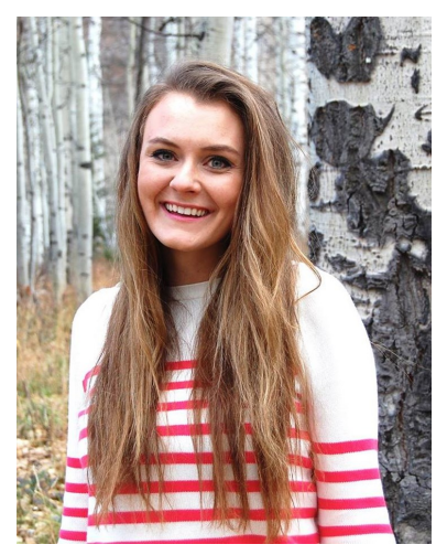
School of Business at BYU.

and will be traveling to Uganda this summer to help at an area orphanage.